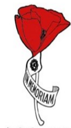
American Legion Auxiliary

We distribute throughout the community in May with emphasis near Memorial Day and all donations received are used exclusively for rehabilitation of veterans and assistance to their families. Since 2005, HB Unit 133 has provided $3,000.00 to $7,000.00 each to support veterans and their families in need identified through the Tibor Rubin VA Medical Center Programs and in partnership with our American Legion Huntington Beach Family.