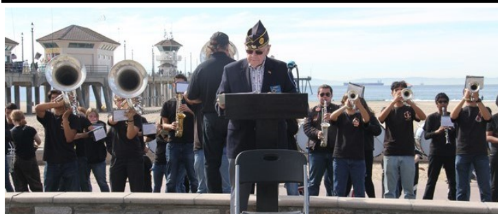
Veterans Day Ceremony pictures.

NONPROFIT ORG U.S. POSTAGE PAID HUNTINGTON BEACH, CA PERMIT 329